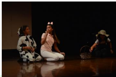
This year Scene and Heard was successfully held on Wednesday 16th October, 2019 at 6pm in the ISPS Theatre. For most students it is their first time on stage. It gives students an opportunity to showcase their work in front of a live audience and get over some of their stage fright.