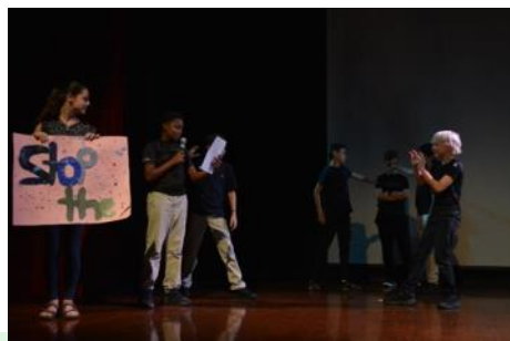
Scene and Heard is a unique project which partners the drama students with their drama teacher to create short plays. Each student has one-on-one supervision which enables him/her to write his/her play. The work is comprised of the student work done during the first Quarter from 6th- 9th Grade.