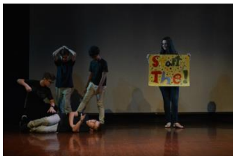
Students of Grade 6 performing a Stop and Start exercise to address Social Issues like Bullying. Their message, "IT BEGINS WITH YOU!!"