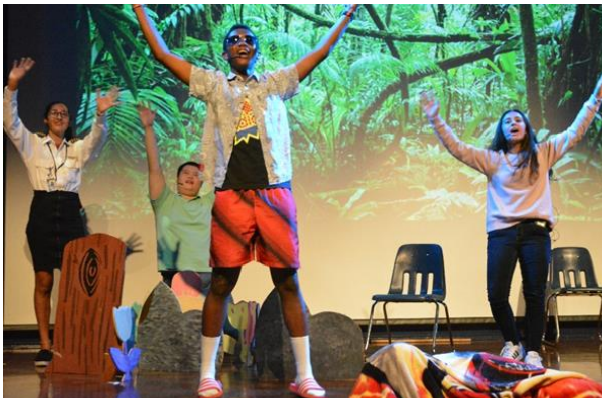
Grade 9 students signaling a plane during their presentation of "Surviving the Amazon."