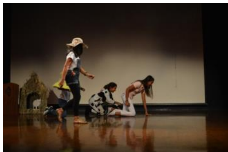
Animal take over! Grade 7 students performing in "The Tale of the strong friendship."