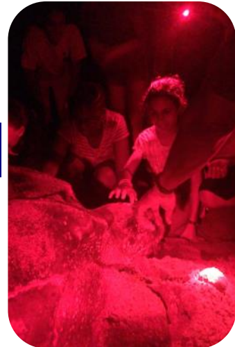
GRANDE RIVIERE TRIP

Grade 7 Science students had a very successful trip to Grande Riviere to observe the Turtles and grade 8 heads to Tobago next week.