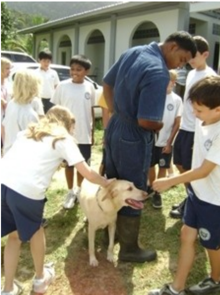
The children from last year's Library Book club had a wonderful time at the Canine Unit when they met Sunny!