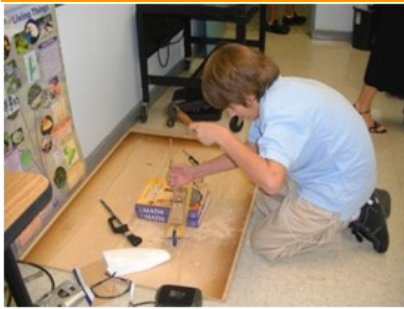
Distance Car Winner