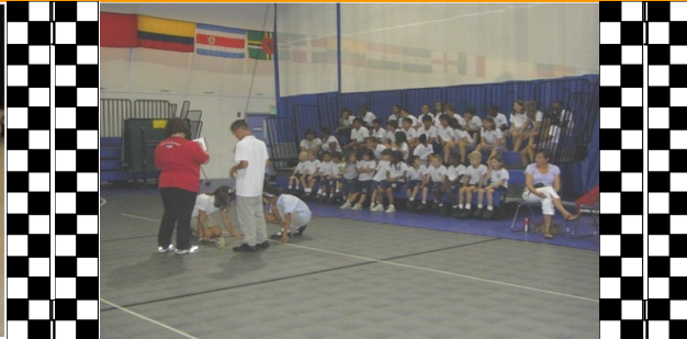
Distance Car Runner-Up