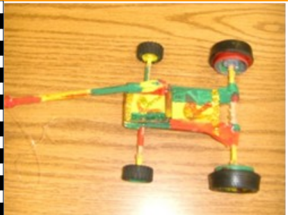
Speed Car Runner-Up