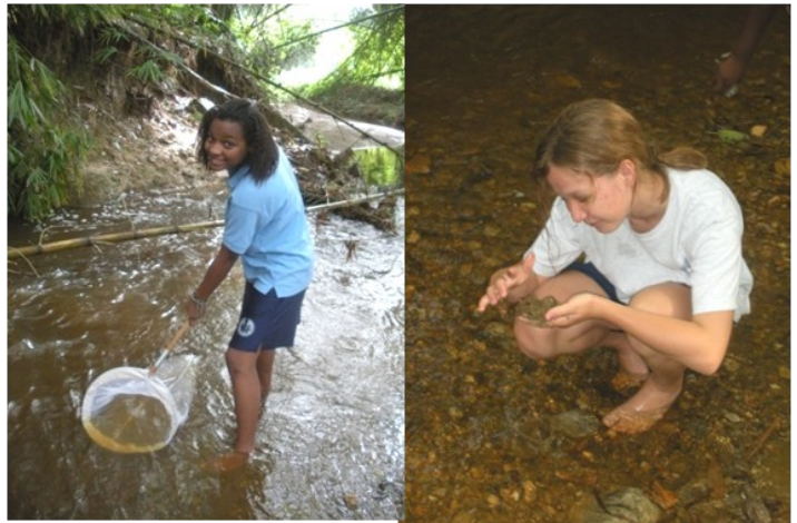
Sydney skimming the surface

7 th grade Watershedders are continuing our adventures! Recently we have been learning about BMIs (no, not body mass index but benthic macro-invertebrates).