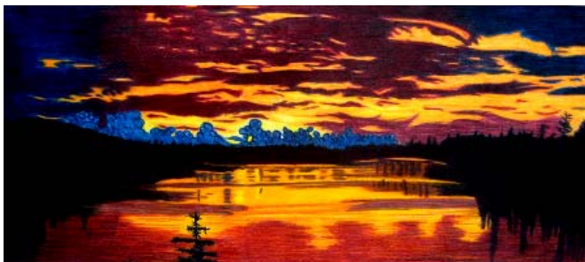
~ Dayna Bayne

Dayna Bayne: Honorable Mention Landscape/Seascape Category